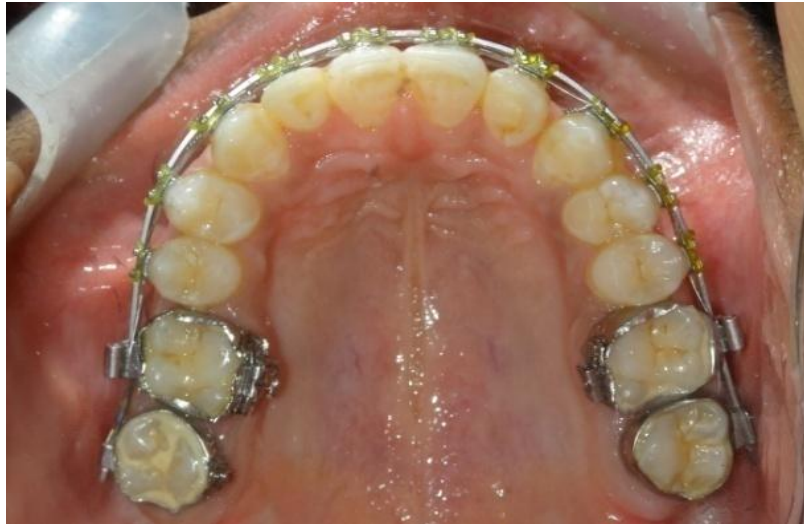
Fig.1 palatally displaced 16