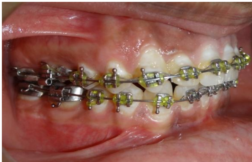
Fig. 2 molar in crossbite