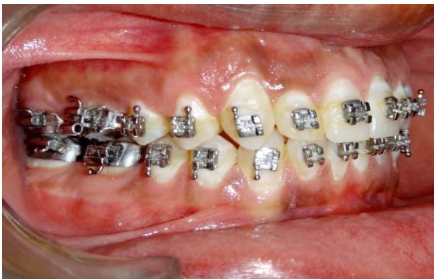
Fig 6: Final correction