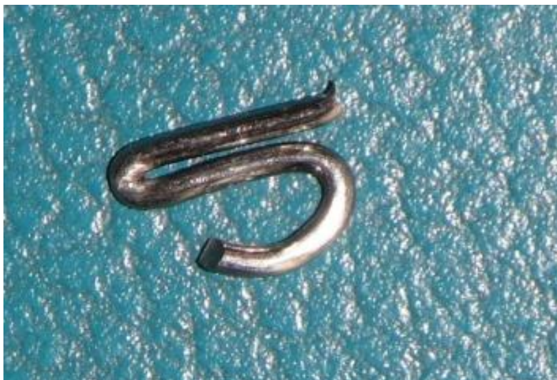
Fig. 3: attachment design for lingual sheath