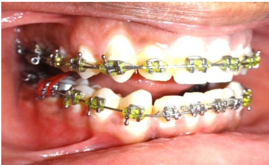
Fig. 5: Inter-arch elastic in place