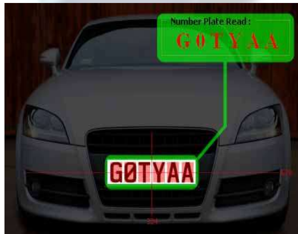
Fig 1: Automatic license plate recognition

In every country, for each vehicle one unique number is allocated for the identification of that vehicle and its owner. The systems like ANPR or LPR playing very crucial role in real life applications such as parking payment, traffic controlling, catching the vehicle which breaks the traffic rules, stolen cars etc. The adaptations of such automated systems are very advantageous as well as reduce many overheads as compared to traditional manual systems. The process of LRP is consisting of complex tasks such as preprocessing, license plate detection, character segmentation and character recognition. This process becomes more complex while working with number plate images at different angels and noises. As this process is usually works under the real life environments, thus this needs to be fast as well as accurate. Many of the LPR system are minimizing the complexity by putting some constraints over the distance and position of camera for vehicle and its inclined angles. If we consider different angles and views of cameras, then the recognition rates increases significantly and hence the LPR system becomes stronger. With this addition there some other features using which we can increase the accuracy of LPR system. In this paper we are presenting the survey over LPR or ANPR system, and explaining it's every step with different methods. In section II we are discussing the different phases included for LPR with survey of different methods presented for them.