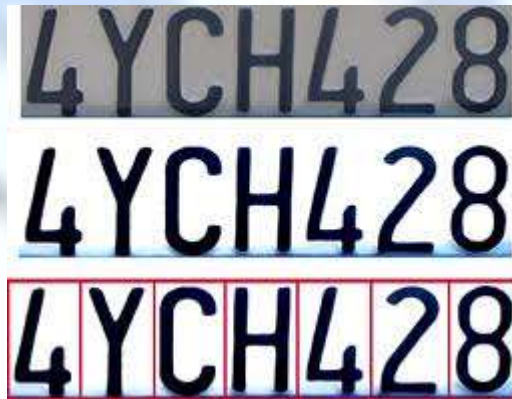
Fig 5: Automatic license plate recognition

An ordinary SOM has the following two layers: 1) an input layer and 2) a computation layer. The computation layer has the processing units. The weight matrix of the SOM is calculated during the learning phase. The hardware designed calculates the hamming distance between the weight matrix of each neuron and the input image and makes a decision on the output character. The recognition rate is 90.93%. 2 types of template matrix or feature vectors are extracted: Object Thinned Representation (OTR) and Characteristics Background Spots (CBS). OTR represents the character shape. CBS reflect the map of the image background within character bounding box. Postprocessor is responsible for refining recognition results by making use of the specific LP context.