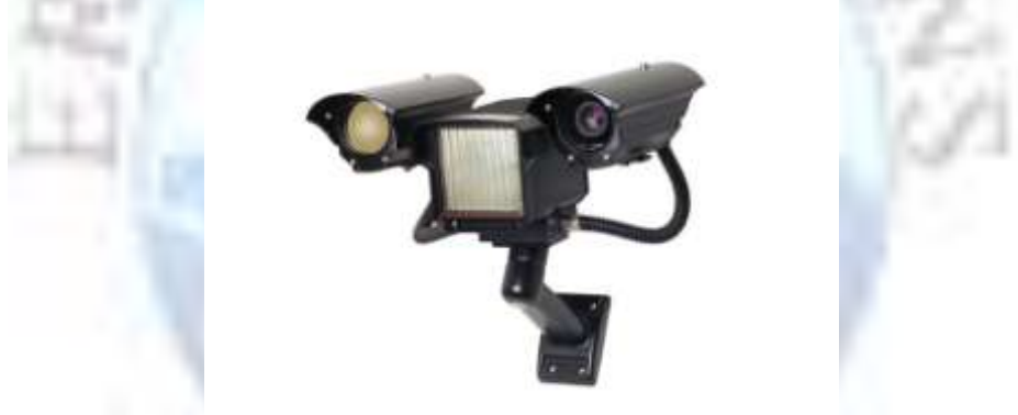
Fig 4: Automatic license plate recognition

Skew Correction: It is not possible to take pictures without any tilt. So for successful recognition of license plate, tilt correction has to be performed after LPD. Skew correction is performed using Randon Transform (RT). But this RT method has a large computation cost. So to reduce the cost, RT is replaced by faster Hough transform. A new skew correction is developed with high speed of operation, high accuracy and simple structure. Both the horizontal and vertical correction is done.