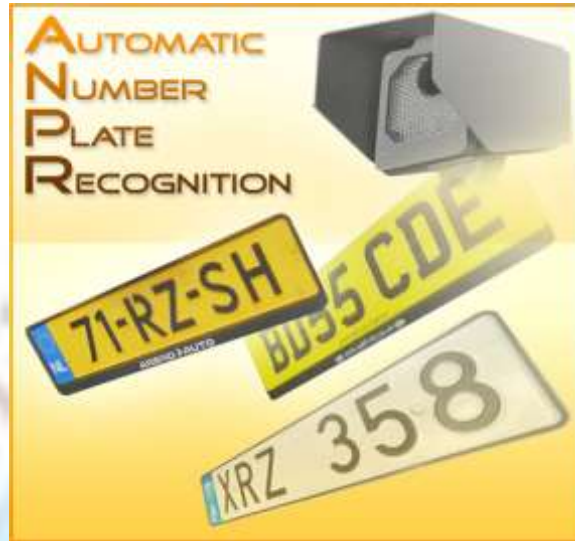
Fig 2: Automatic license plate recognition

2.1 Image Acquisition: This is the first phase of LPR system in which the input is given to the next phases. These images are taken directly from the videos or cameras. The quality of such images is based on the quality of cameras. Hence it's always better if we have good quality cameras in place for capturing the images live. The images are always in different sizes, different orientations and directions etc.