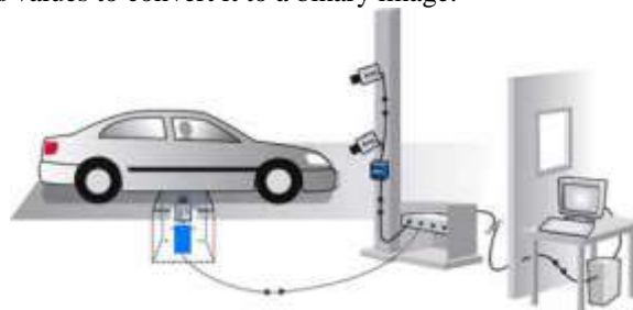
Fig 3: Automatic license plate recognition

2.3 Detection of License Plate: Once after the preprocessing step, the next is to detect the license plate from vehicle image. LPs (License Plates) are located by means of horizontal and vertical projections through search window. If the LP is not found using the above method then the original image is inverted. Since LPs are located at the bottom part of the image, projection histograms are scanned from the bottom to the top so that the height of the LP can easily be