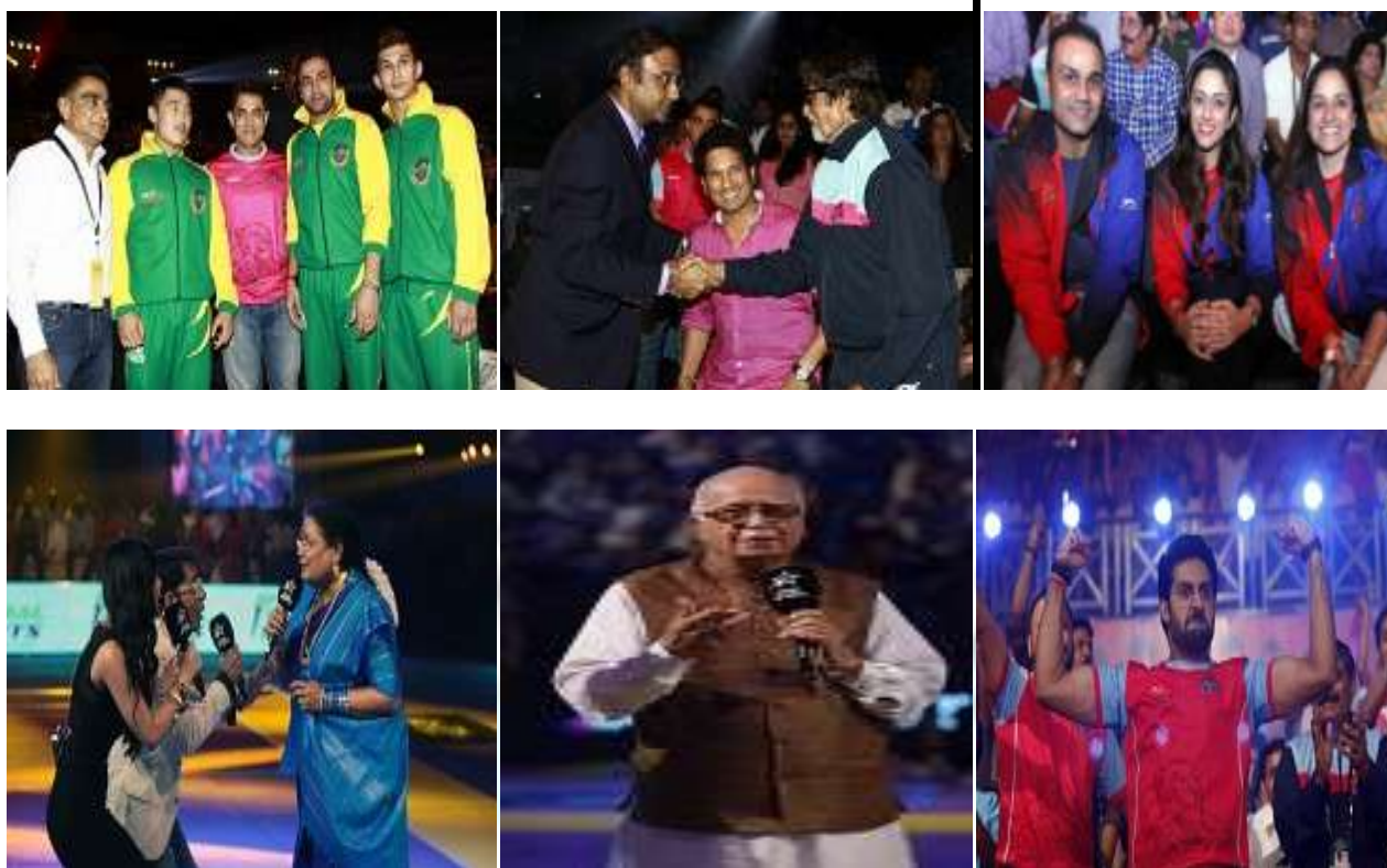
Figure : Celebrities supporting Pro Kabaddi