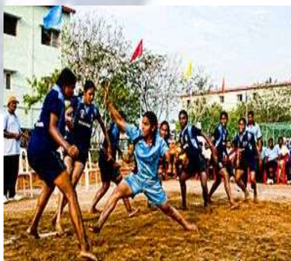
Figure: Kabaddi Courts