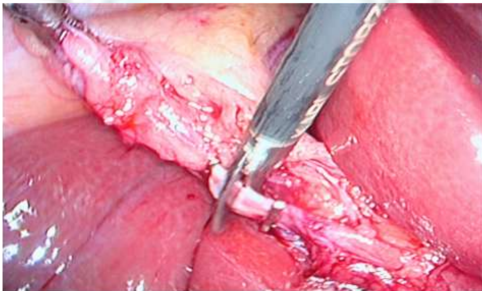
Fig 4. Cystic artery ligation