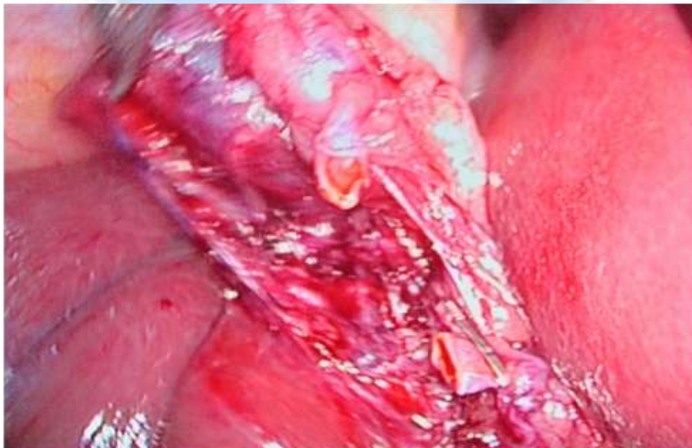
Fig 2. Showing posterior dissection