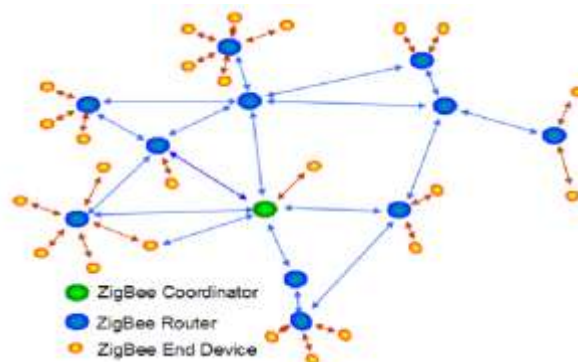
Star Mesh Topology