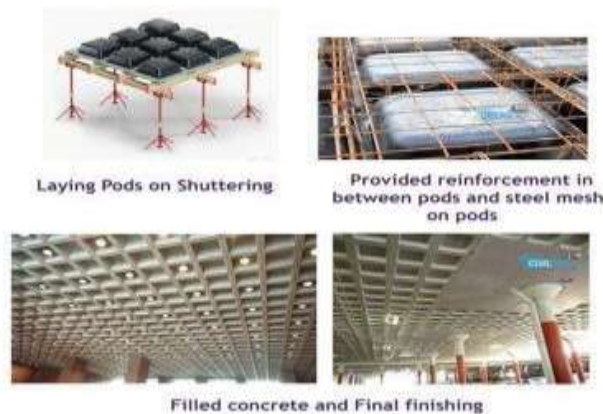
Fig -3: Waffle Slab

Waffle slab is a strengthened concrete roof or ground containing rectangular grids with deep facets and its miles referred to as grid slabs. This type of slab is majorly used for hotels, Restaurants Malls, for right pictorial view. It is normally used in which massive spans are required (e.g. auditorium, cinema halls) to keep away from many columns interfering with space.