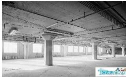
Fig -1: Flat Slab

shorter storey height & captivating appearance. Flat slabs are normally utilized in parking decks, business buildings, resorts or locations in which beam projections are not desired.