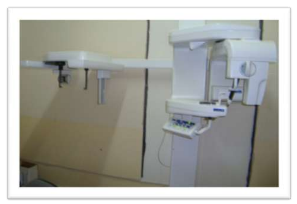
Figure (1): Digital Cephalometric Machine