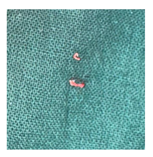
Figure-5: Extruded GP fragments removed

The apicoectomy of the roots was done using a fissured tungsten carbide bur, 3 mm from the radicular vertex.Retro cavities were created using ultrasonic tips, followed by the filling of the cavities with Biodentine .[Figure 6]. The flap was repositioned and sutured using 3-0 black silk suture.