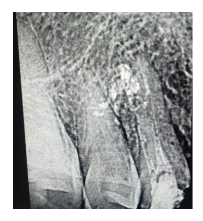
Figure-2: Overextended filling material w.r.t 14