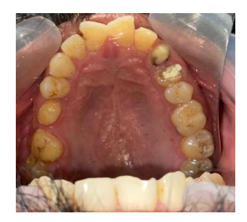
Figure-1: Preoperative clinical picture of unrestored right maxillary 1st premolar

Initially, a conservative retreatment approach was presented to the patient which involved removalof overfilled gutta percha. Approval for the treatment was obtained, and local anesthesia was administered for the patient's comfort. The access cavity was opened, and the gutta-percha in the coronal third region was removed using Gates Glidden burs. and in the middle section by H files. For removal in apical region with an H-file (size 25) it led to the breakage of gutta-percha beyond the apical foramina. [Figure 3].