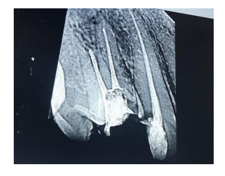
Figure-7: Obturation w.r.t 14

The patient was prescribed oral medications, including antibiotics and analgesics, to manage postoperative inflammation and pain. Patient was recalled after 1 week for suture removal and there were no post-surgical complications. After 1 week the patient was completely asymptomatic with no tenderness to palpation and then obturation was performed after thorough chemo mechanical debridement of the canals. [Figure 7].