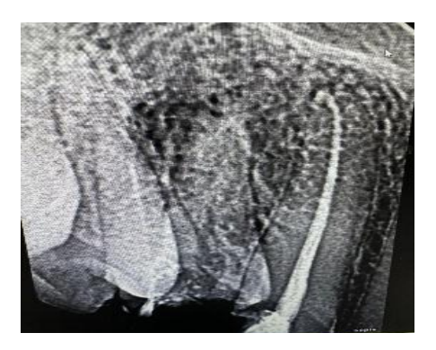
Figure-6: Root resection and retro preparation with biodentine

The apicoectomy of the roots was done using a fissured tungsten carbide bur, 3 mm from the radicular vertex.Retro cavities were created using ultrasonic tips, followed by the filling of the cavities with Biodentine .[Figure 6]. The flap was repositioned and sutured using 3-0 black silk suture.