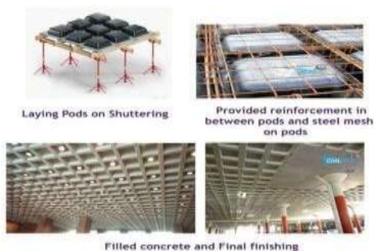
Fig -3: Waffle Slab