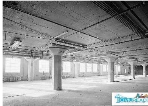
Fig -1: Flat Slab

Flat Slabs are used to offer simple ceiling floor giving higher diffusion. Larger headroom or shorter storey height & captivating appearance. Flat slabs are normally utilized in parking decks, business buildings, resorts or locations in which beam projections are not desired.