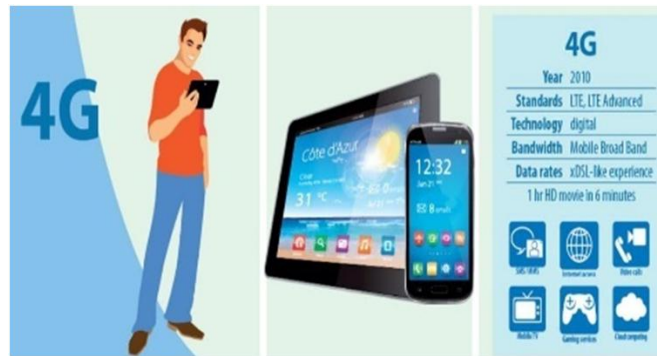
Figure.4: 4G Technology and devices