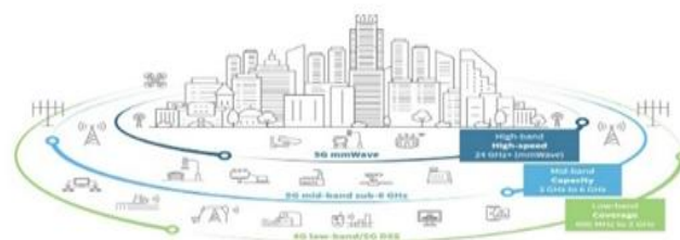
Figure 6: 5G Technology frequency bands

This is why the radio frequencies used by 5G, known as "millimeter waves," range from below one GHz to exceedingly high frequencies (or mm Wave). The signal can travel further the lower the frequency. The more data that can be carried, the higher the frequency.