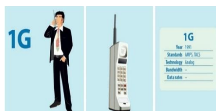
Figure 1: 1G Technology and devices

The 1980s saw the development of 1G. It has an analogue system that can support cell phones from the first generation at speeds of up to 2.4kbps shown in fig1.1. It introduces mobile technologies such push to talk, the improved mobile telephone the advanced mobile telephone system, and the mobile telephone system (MTS) (PTT). It makes use of analogue radio signals with a 150 MHz frequency. The method used for voice call modulation is known as frequency division multiple access (FDMA). Users can use it to make voice calls within a single nation. However, it had a low capacity, erratic handoff, poor voice connectivity, and no security at all because voice calls were replayed in radio towers, making them vulnerable to uninvited third party eavesdropping [4].