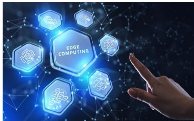
Figure 8: 5G Technology architecture cloud and Edge

These edge networks can be utilised for services offered at the edge in the 5G network architecture. These 5G core tasks can be virtualized, so you could run them on regular server or data centre hardware with fibre running to the radio that broadcasts the signal. Thus, just the radio is specialised while the rest is rather normal.