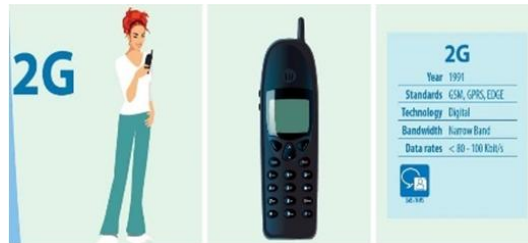
Figure 2: 2G Technology and devices

In the late 1990s, 2G first appeared. released commercially in Finland using the GSM protocol (1991). It has a speed of 64 kbps and transmits voice via digital signals shown in fig 1.2. The 2G network offers services including text messages, image messages, and Multimedia Messaging Service (MMS), which uses the bandwidth of 30 to 200 KHz, and allows for significantly larger penetration intensity. Text communications are encrypted digitally. In comparison to 2G, the 2.5G system offers a data rate of up to 144 kbps while using a packet switched and circuit switched domain. Consider GPRS, CDMA, and EDGE[2].