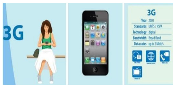
Figure 3: 3G Technology and devices

The third generation of smart phones saw the introduction of web surfing, email, video downloads, photo sharing, and other services, as shown in figure 1.3. Third-generation mobile communications, which went on sale in 2001, was designed to cut costs while increasing data capacity and simplifying voice and data traffic[5].