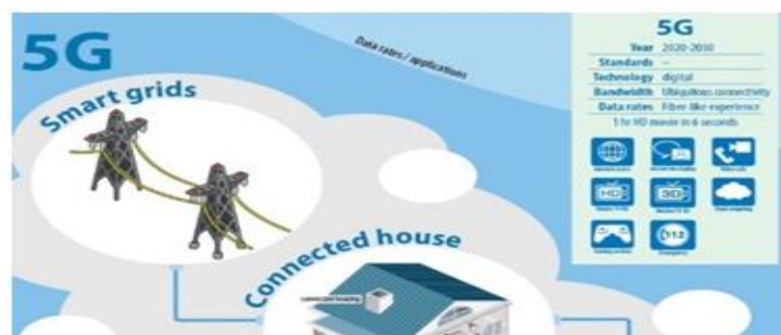
Figure.5: 5G Technology and devices

Additionally, 5G networks with network cut-off structures enable telecommunications providers to provide consumers with much-needed connectivity while upholding SLAs (SLA). Delays, data speed, dependability, quality, services, and security are a few examples of specialized network skills.