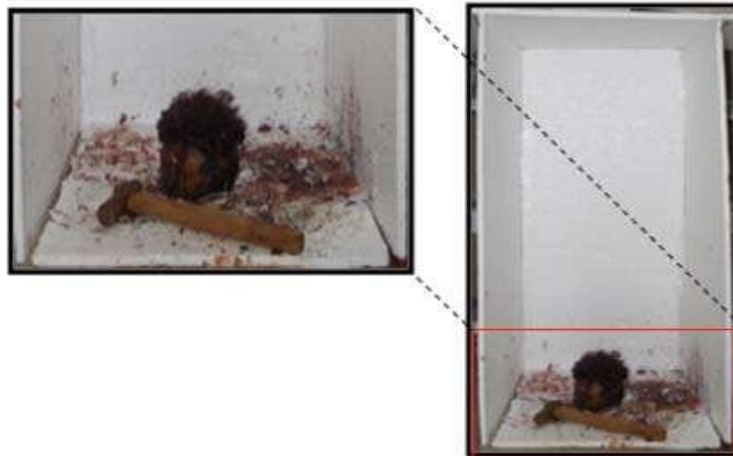
Figure 1: Experimental Setup replicating the event of a head hit. As the authors were not inclined towards recording the stains (particularly cast off and impact spatter patterns) formed on the walls and ceilings for a particular height of the victim, perpetrator, number of hits made by the perpetrator, hence this setup was constructed.

In order to minimize or control property damage the hammer was dropped on a paper sheet (A3 size) placed on a thermocol sheet (refer Figure 2).