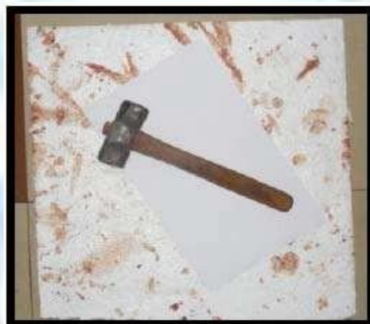
Figure 2: Thermocol sheet placed on the floor to avoid damage of the floor tiles. Paper sheet is placed on the thermocol sheet and hammer is dropped on the paper sheet by measuring the fall height from the top of the thermocol sheet.

In order to minimize or control property damage the hammer was dropped on a paper sheet (A3 size) placed on a thermocol sheet (refer Figure 2).