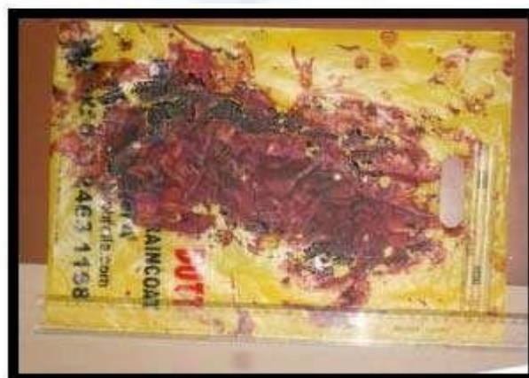
Figure 3: Dried up 30 cc blood pool created on a plastic sheet. The blood pool was not created on paper as the paper surface would cringe on the drying of the 30 cc(ml) blood pool.

The height of the victim/perpetrator was not taken into account in the study as the authors did not want to record the cast off, fingerprint transfer stain patterns that might be formed as a result of head hit. It is shown below in Figure 3.