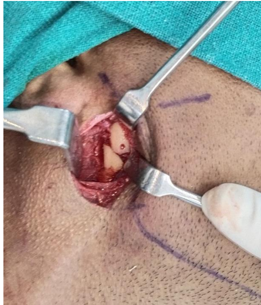
Fig.4 showing overlapping proximal and distal fragments