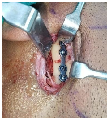
Fig.5 showing fixation after anatomic reduction