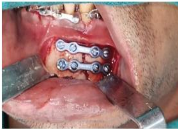
Fig.2 showing fixation using 2 four hole with gap miniplates