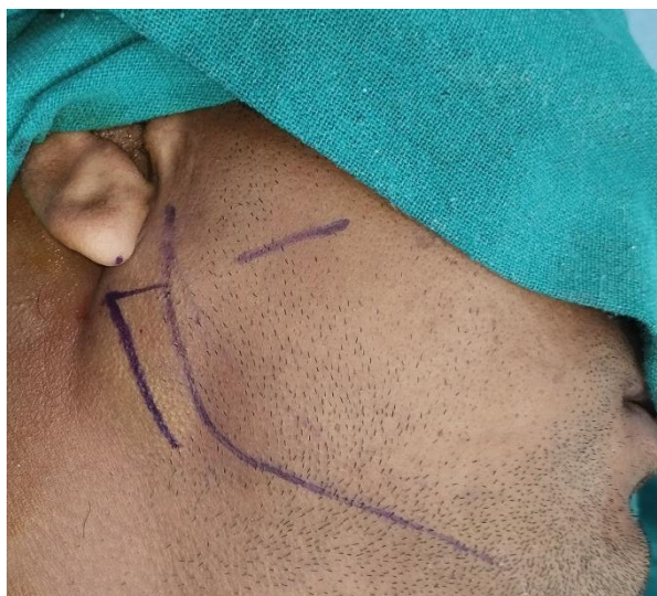
Fig.3 showing marked hind's incision